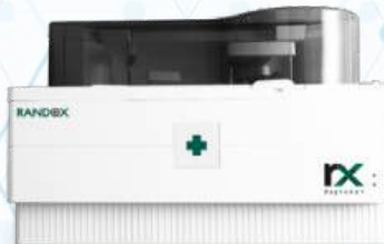
Randox RX Daytona Plus Fully Automated Bipchemistry Analyzer