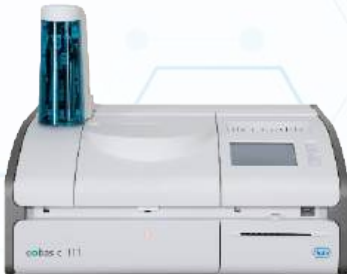
Roche Cobas C111 Fully Automated Chemistry Analyzer