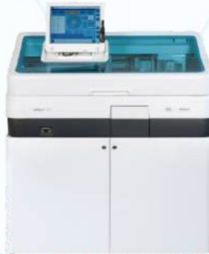
Roche Cobas E411 Fully Automated Chemistry Analyzer