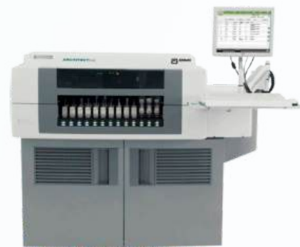
ARCHITECT I1000SR Abbott Fully Automated Chemistry Analyzer