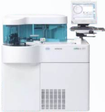
Roche Cobas C311 Fully Automated Chemistry Analyzer