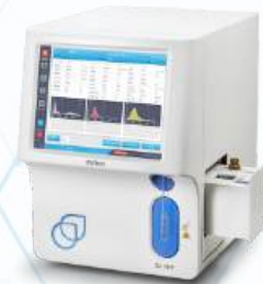
Zybio Z3 CRP Fully Automated Hematology Analyzer